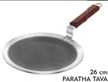
26 cm PARATHA TAVA