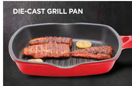
DIE-CAST GRILL PAN