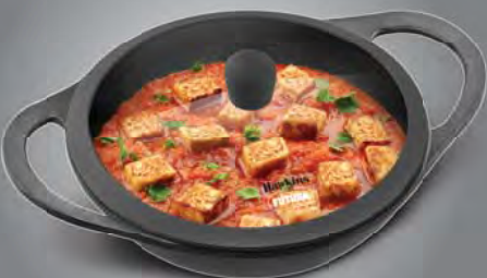
CAST IRON KADHAI