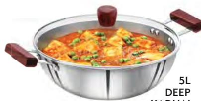
5L DEEP KADHAI