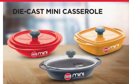
DIE-CAST MINI CASSEROLE